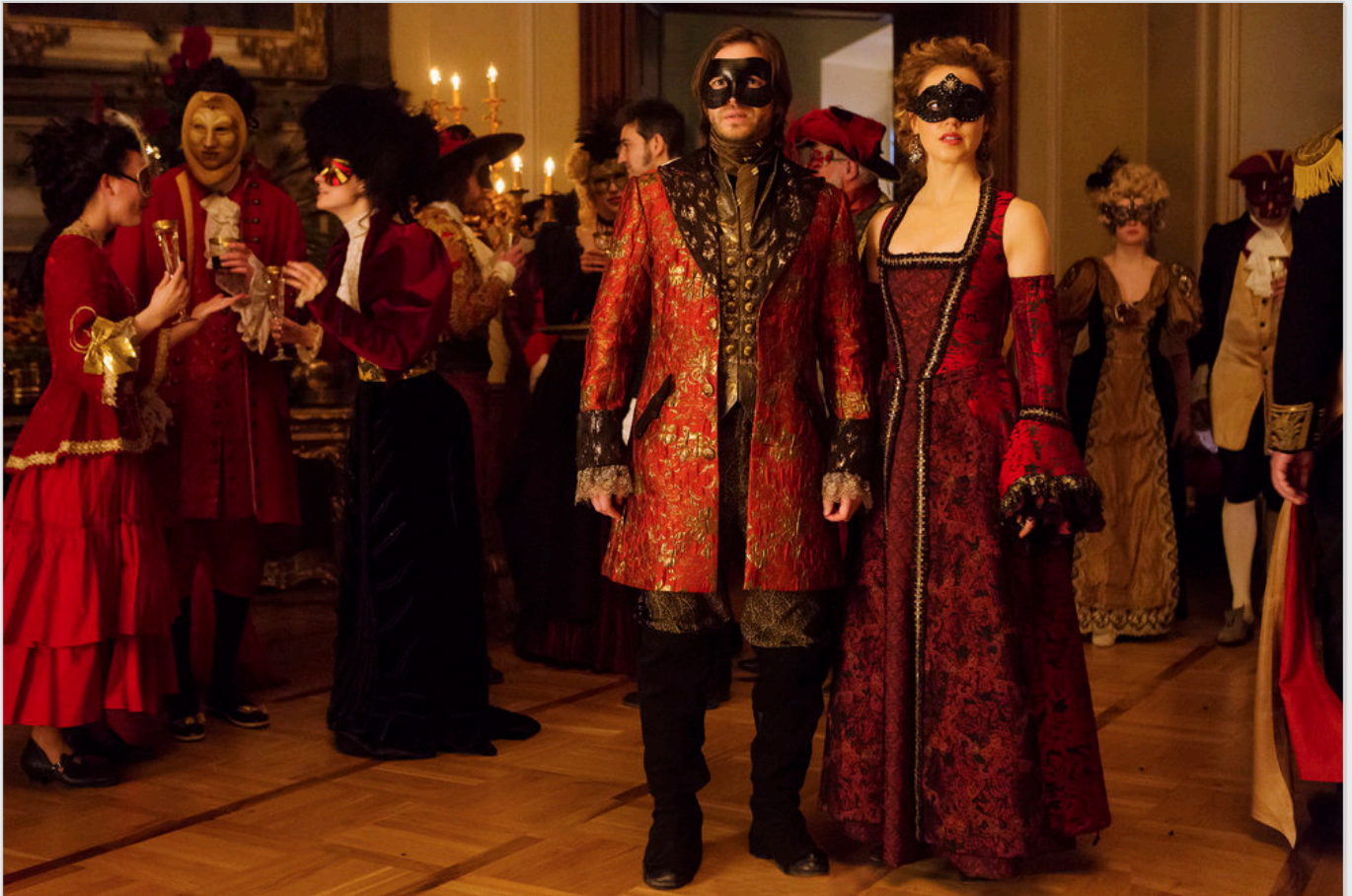
Inspired by Poe's Masque of the Red Death, perhaps?