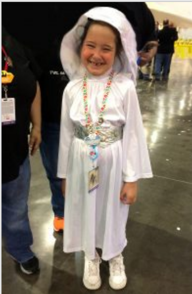
Little fan as Princess Leia at Star Wars Celebration

In his moving talk, Mark Hamill (Luke Skywalker) began by saying, “Here’s a panel I hoped we wouldn’t have for another 30 years.” After pausing for a moment of obvious emotion, he then went on to share many of his favorite personal stories of Fisher. Hamill also played touching video tributes from both director Lucas and Lucasfilm president Kathleen Kennedy.