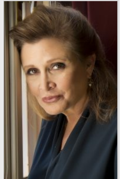
Actress Carrie Fisher is remembered at Star Wars Celebration Orlando

The Star Wars Celebration convention is often touted as creator/director George Lucas's love letter to fans, and never more so than this year's 40th anniversary event in Orlando. What began as a little "space opera" opening with ten simple words shining blue on a black screen: "A long time ago in a galaxy far, far away...." has grown into a powerful film franchise spanning decades, and has attracted an enormous global audience of fans both young and old.