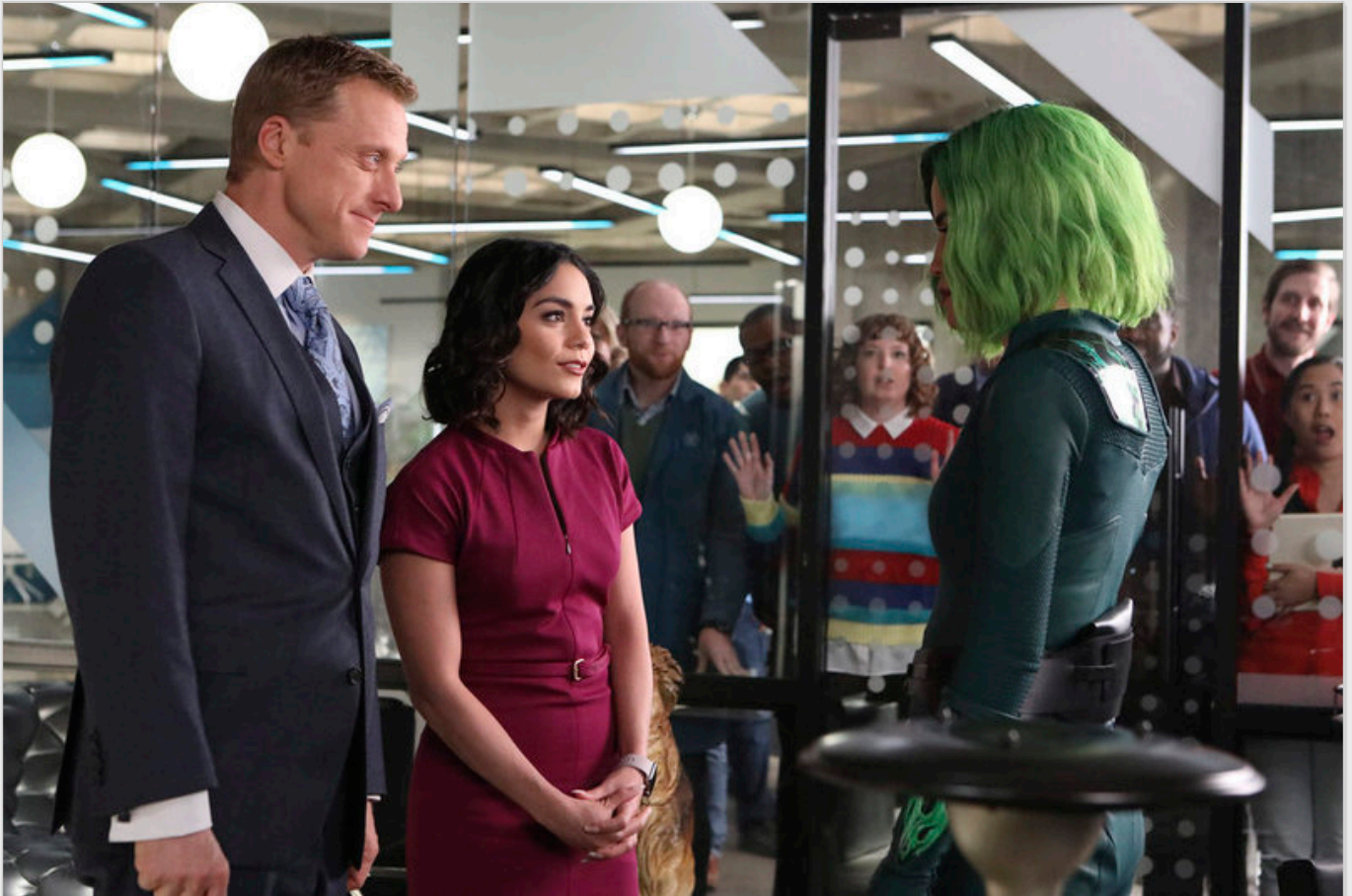
Van, meet Green Fury.

The team looks at Emily's "prize", with Teddy (Danny Pudi) being furious because he's still hung up on the firey lass.